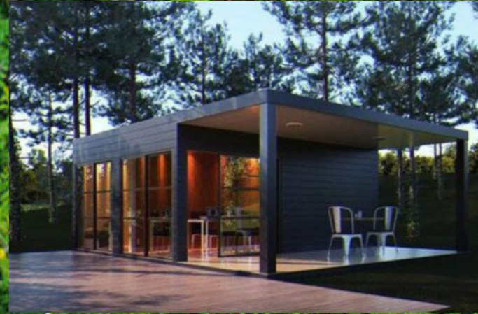
Tiny-home village provides lodging for visitors